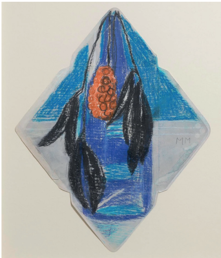
Black Leaves in Blue Bottle c.1990 Crayon on envelope 31 x 24cm